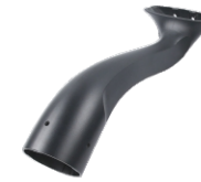
2 Lamp holder