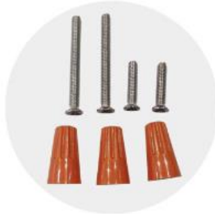
INSTALL SCREWS AND TERMINALS