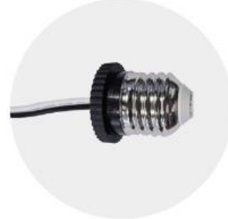
E27 LAMP HOLDER